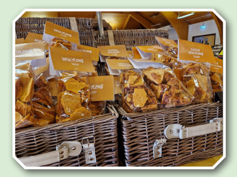
Food Fair: 22nd February

The Food Fair will be held in Buckingham Community Centre on Saturday 22nd February 2025 from 10am to 3pm, showcasing lots of local producers. There will also be some great food traders located outside the community centre, delivering various tasty dishes.