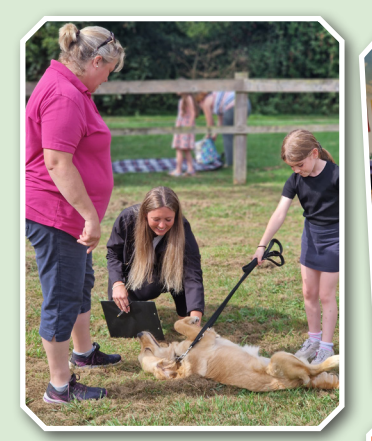
Dog Show: Saturday 7th September