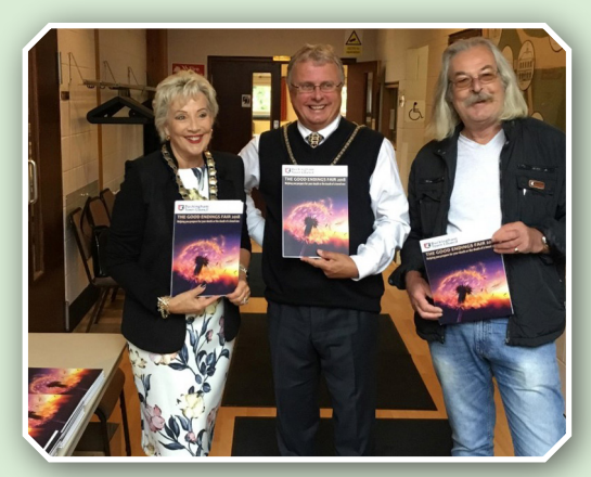
Good Endings Fair: 29th March

The Good Endings Fair , taking place on 29th March 2025, is a chance to meet with people and businesses involved in what happens when a death occurs, to begin that conversation with loved ones, and to think about putting plans in place so that loved ones don't have to.