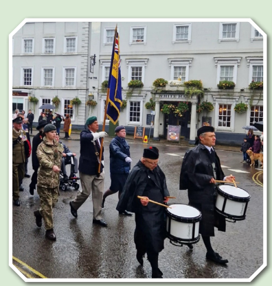
Remembrance Day Parade: 10th November

for children to enjoy. The aim of the Winter Fair event is to bring