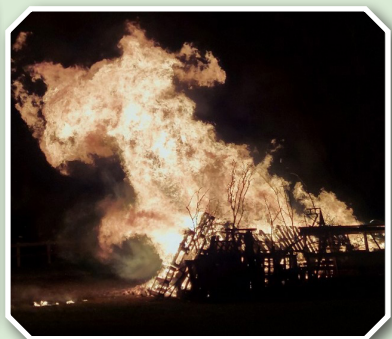
Bonfire and Fireworks: Saturday 2nd November

Buckingham hosts numerous fantastic events each year bringing fun, tasty food, great shopping, music, and visitors to Buckingham. Our events are a great opportunity for local businesses to build their brand, listen to customers, and try out new products!