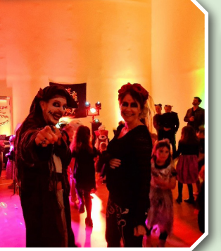
Halloween Disco: Friday 25th October