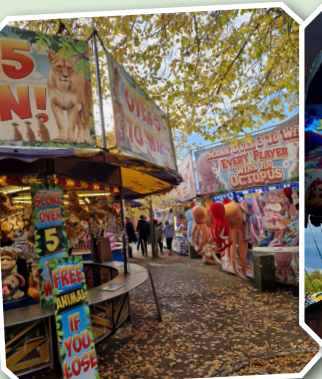
Charter Fair: 12th & 19th October