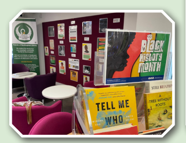
Black History Month Display at Buckingham Library