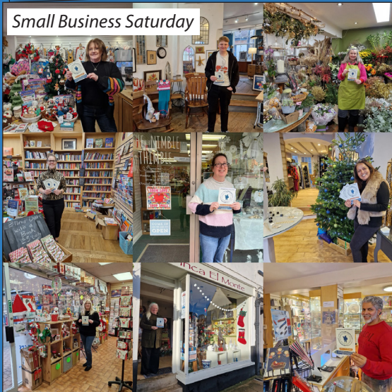
Small Business Saturday